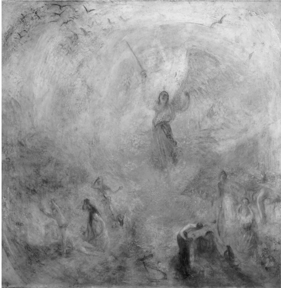
Figure 3 J.M.W. Turner, The Angel Standing in the Sun (1846).