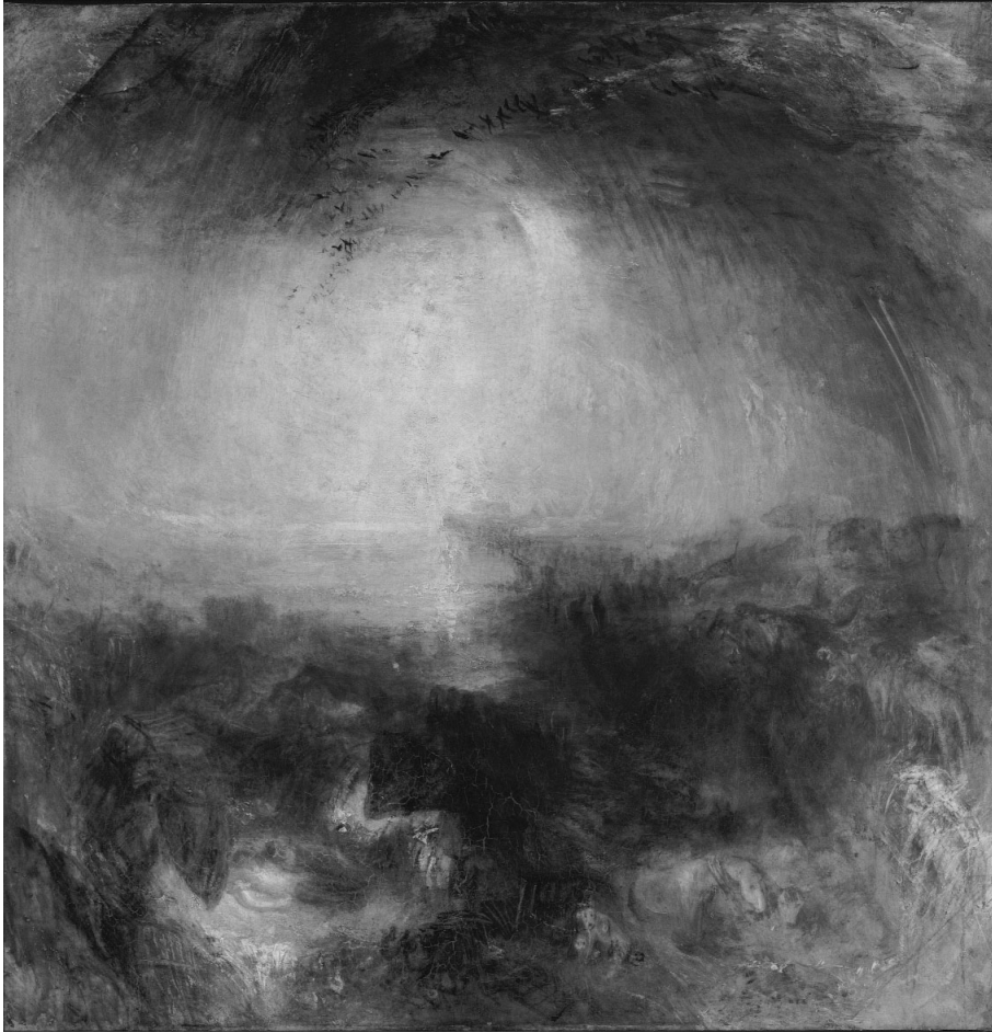
Figure 2 J.M.W. Turner, Shade and Darkness: The Evening of the Deluge (1843).

and supra-rational dimensions. Rather than solving the disputes between Goethe and Newton, Romanticism and Enlightenment, or Religion and Reason, the painting dazzlingly represents the temporal and spatial instabilities of modernity, haunted by the ghosts of the Atlantic slave trade and the Enlightenment.