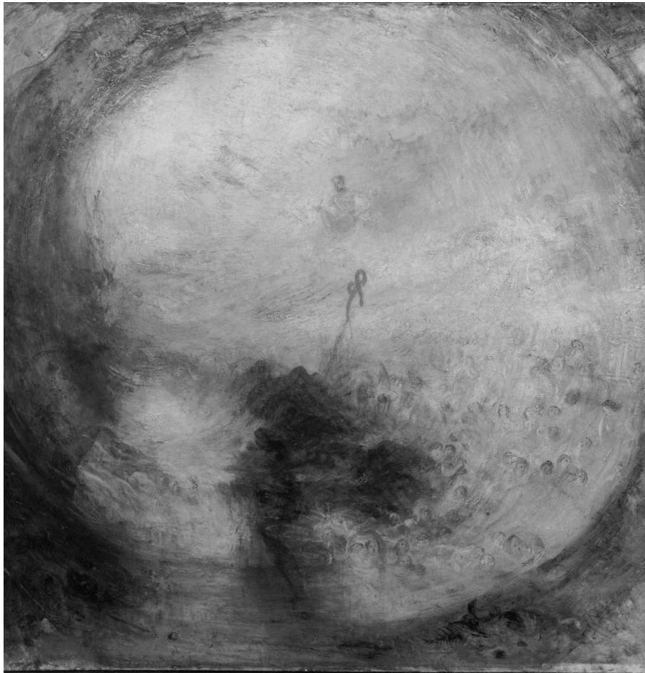
Figure 1 J.M.W. Turner, Light and Colour (Goethe’s Theory) – The Morning After the Deluge – Moses Writing the Book of Genesis (1843).

old and new models, the very ‘threshold of our modernity’ (Crary, 1991: 71). At the same time, Goethe was Carlyle’s ‘chosen specimen of the Hero as Literary Man’, whom he visualized as having a ‘vision of the inward divine mystery: and strangely, out of his books, the world rises imaged once more as godlike, the workmanship and temple of a God’ (OH: 136). This description might bring to mind J.M.W. Turner’s Light and Colour (Goethe’s Theory) – The Morning After the Deluge – Moses Writing the Book of Genesis (1843), an image of the newly risen world after the Flood (see Figure 1). The same painting is cited by Crary as evidence of the ‘new status of the observer’. One might also make a case that this picture, painted two years after the publication of On Heroes , illustrates Carlyle’s Hero within the camera-obscura theory of tradition and his vision of Goethe’s ‘mild celestial radiance’ (OH: 136).